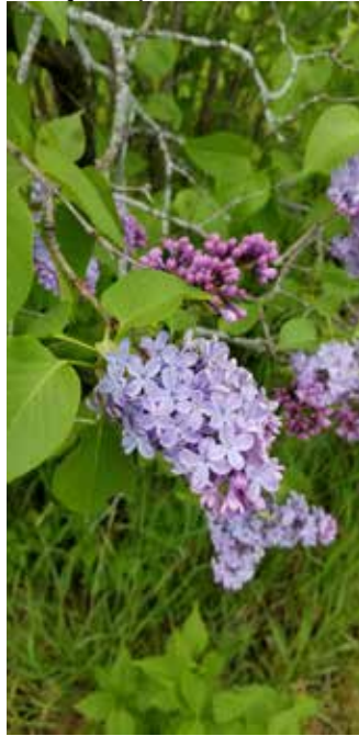
May 24, 2019