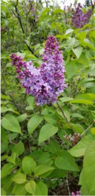
May 23, 2019