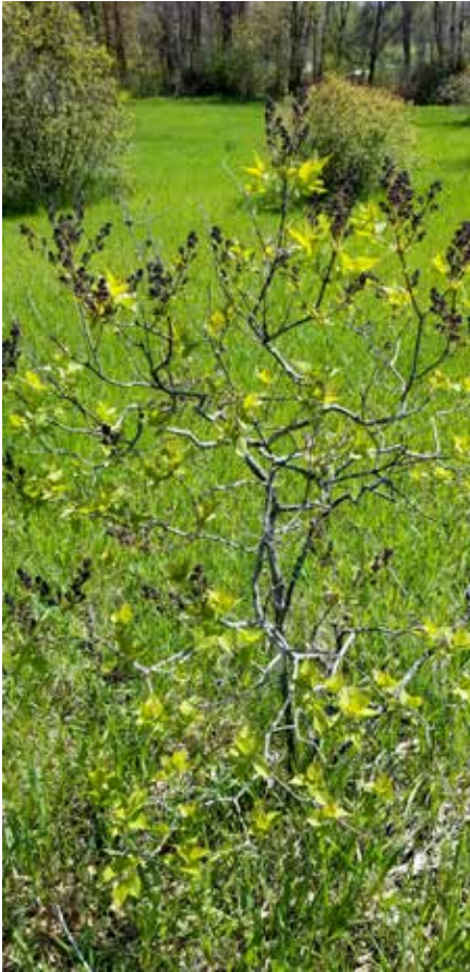
May 15, 2019